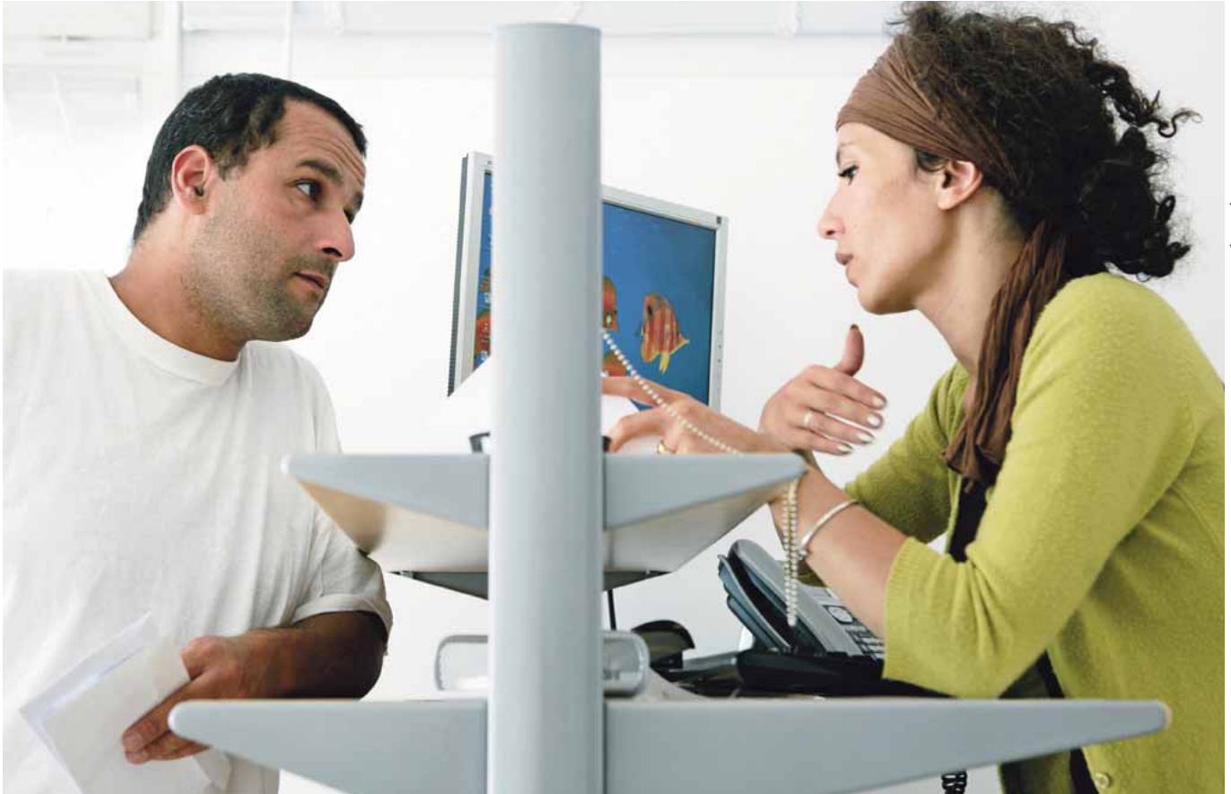
EDF is working with the Foundation for Action to Combat Exclusion ( Fondation agir contre l'exclusion - FACE) to help the reintegration of those in difficulty.

face of dwindling gas production in the North Sea and of climate change. The company demonstrated the advantages to combining energy efficiency, nuclear and renewable energy.